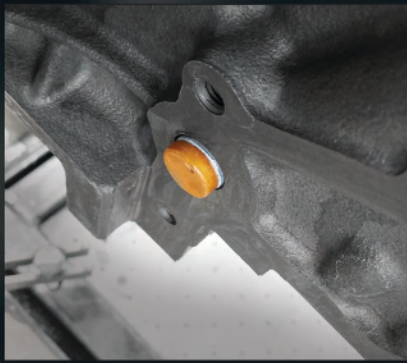
Oil Galley Plug