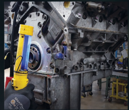
Black Light Leak Test

Cylinder bores are honed with a steel torque plate that is torqued with ARP2000® bolts to simulate cylinder bore distortion, which occurs after head assembly, ensuring correct bore roundness for improved ring sealing.