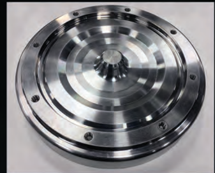
100% NEW Billet Front Cover.

JASPER prevents hydraulic leaks by installing solid PTFE stator support seals.