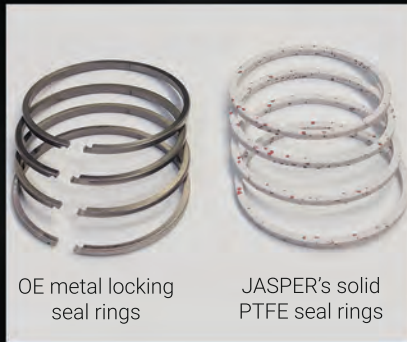
OE metal locking seal rings