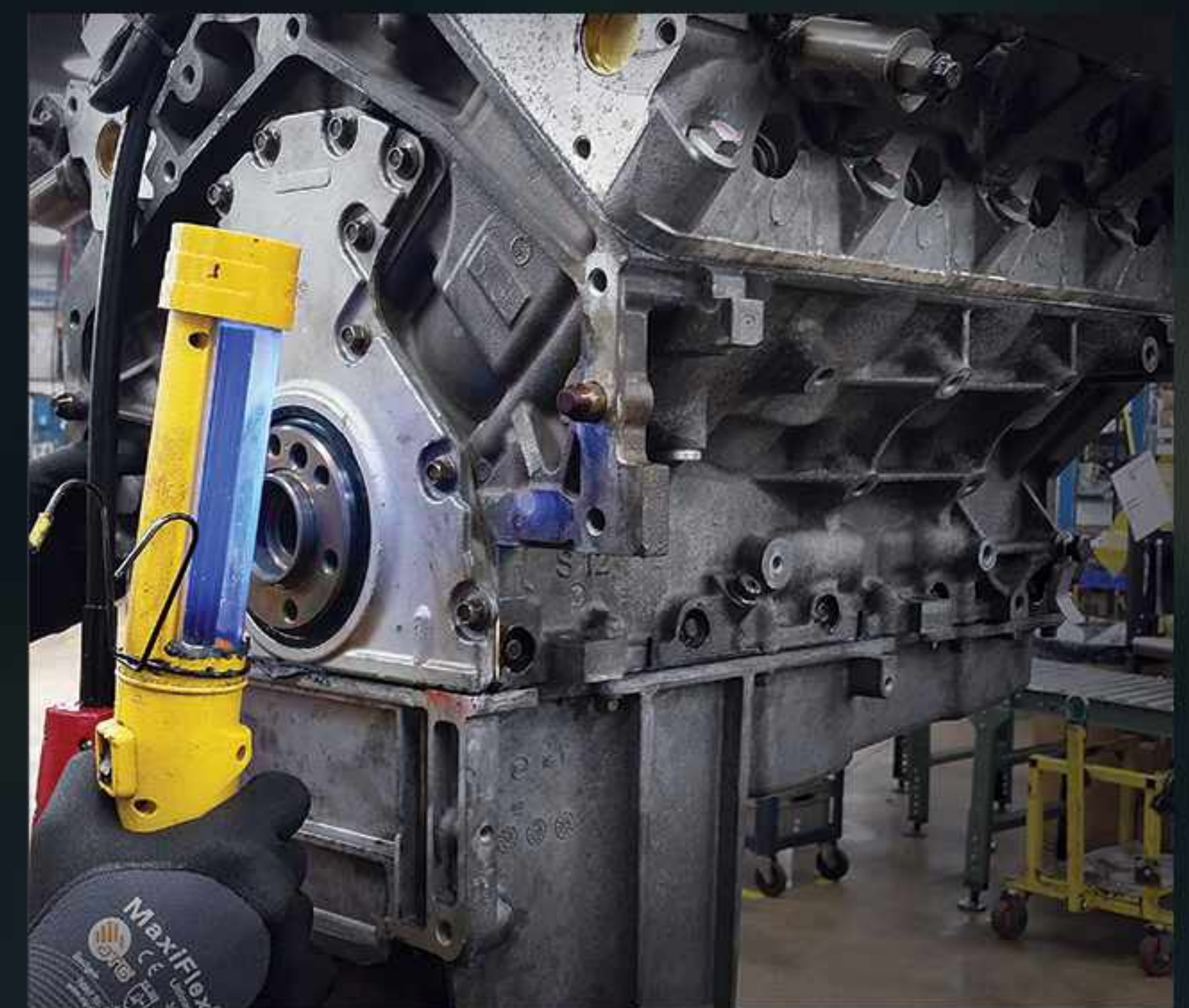
Black Light Leak Test

Cylinder bores are honed with a steel torque plate that is torqued with ARP2000® bolts to simulate cylinder bore distortion, which occurs after head assembly, ensuring correct bore roundness for improved ring sealing.