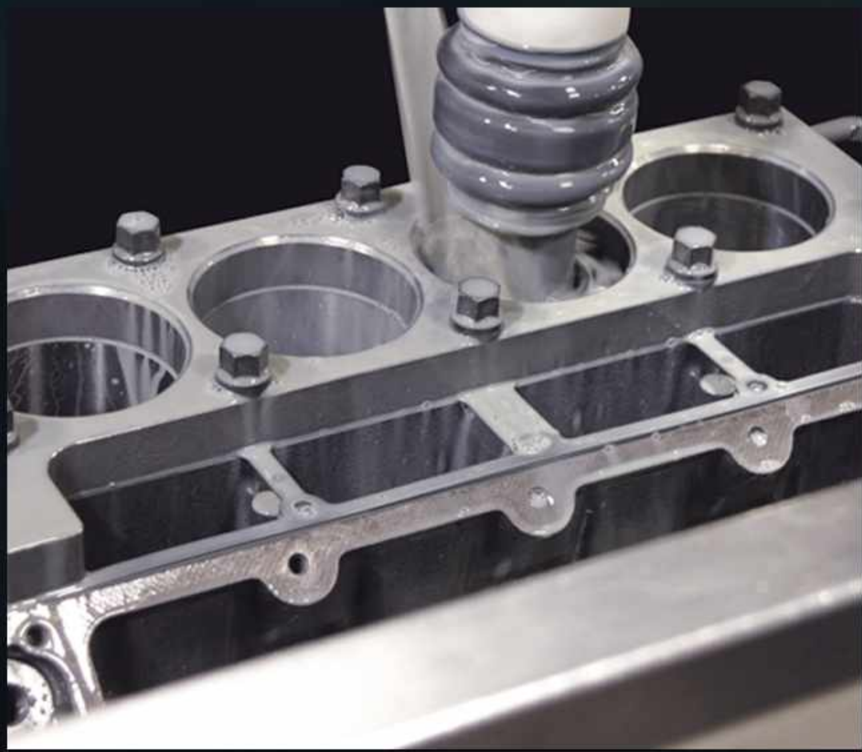
Torque Plate Honing