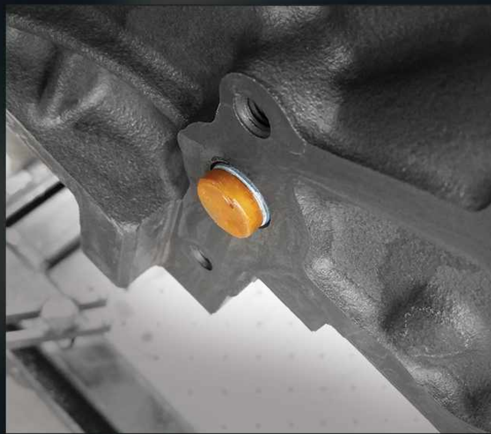
Oil Galley Plug