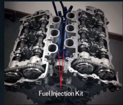
Fuel Injection Kit